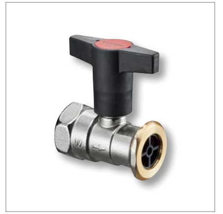
Pump ball valve "Optibal P" with check valve