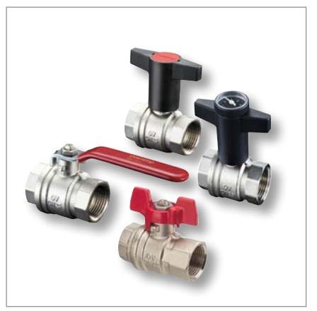
Brass ball valves