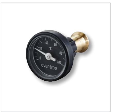
Thermometer conversion set

Oventrop brass and bronze ball valves "Optibal" with full flow are used in industrial, commercial and domestic installations for the isolation of pipes transporting fluids.