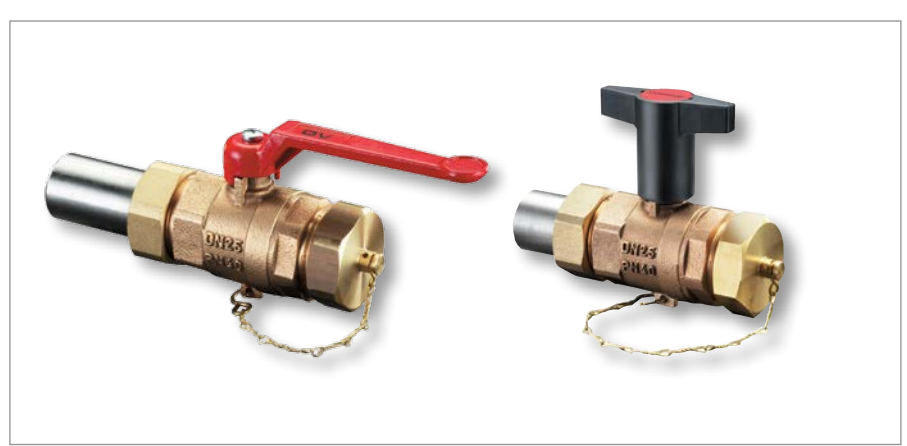
Bronze ball valves