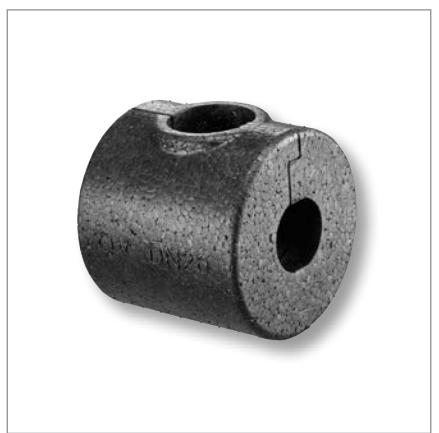
Insulation made of expanded polypropylene