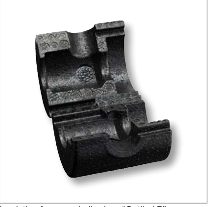
Insulation for pump ball valves "Optibal P"

The bronze ball valves for potable water "Optibal TW" with full flow according to DIN EN 13828 (DN 15-DN 80) feature plugged draining orifices G ¼ on both sides. The ball is always surrounded by water and the valve does not feature a dead zone. For the direct connection of copper pipes according to EN 1057 and stainless steel pipes "NiroSan", the ball valve "Optibal TW" is also available with press connection on both sides.