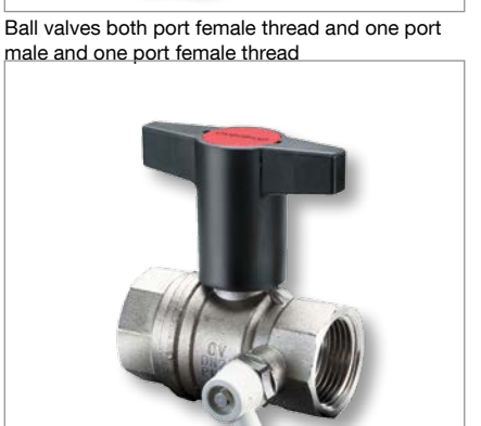
Ball valve with draining valve