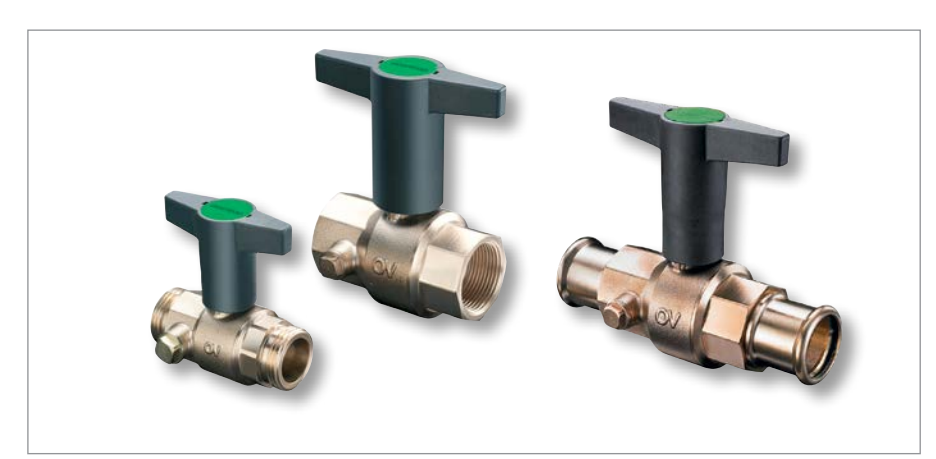
Bronze ball valves "Optibal TW" for potable water