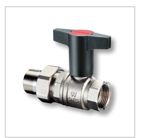
Ball valve with coupling