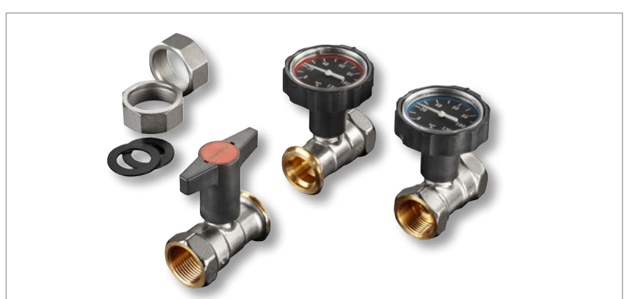
Isolating set "Optibal PK"